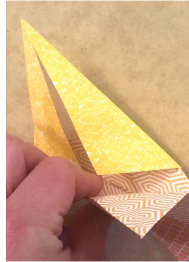
12. The flap you unfolded should then fold back behind the new shape you added