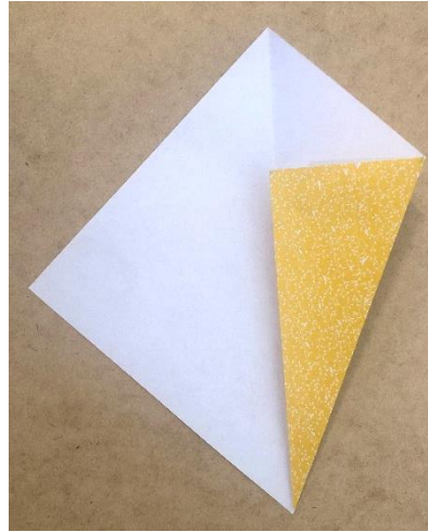
3. Fold up the bottom right corner as shown above following the centre line