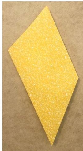
6. Flip the shape over by taking hold of the bottom point so that the bottom is now at the top