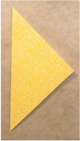
1. Fold your Square in half to create a triangle