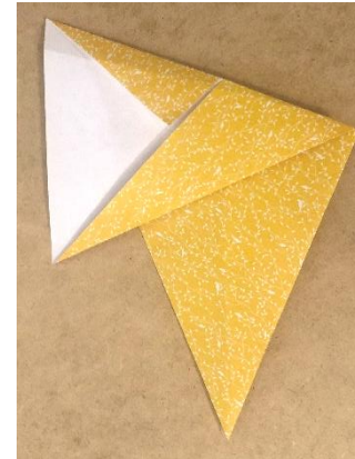
8. Your shape should now look like this