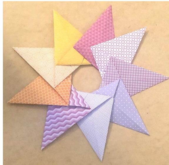
15. Flip it over to see how it looks on the other side and experiment with the size of your squares to create different sizes