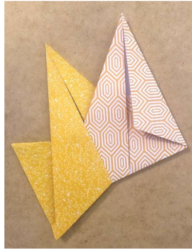
11. Slot one shape inside the other like this