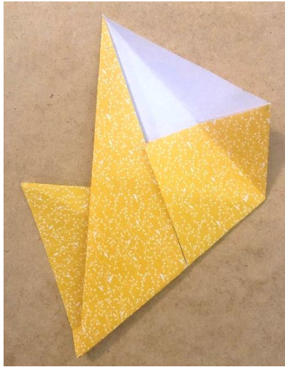
10. Slightly unfold the top right flap