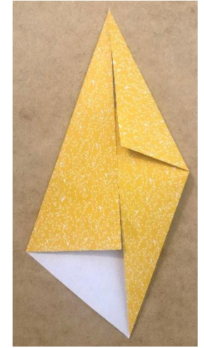
5. Fold the top right point down as shown in the picture