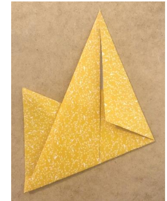
9. Flip your shape over so it looks like this. Now repeat steps 1-9 until you have 9 pieces like this