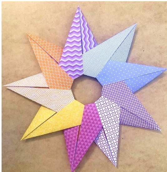
14. You will end up with a lovely origami star like this