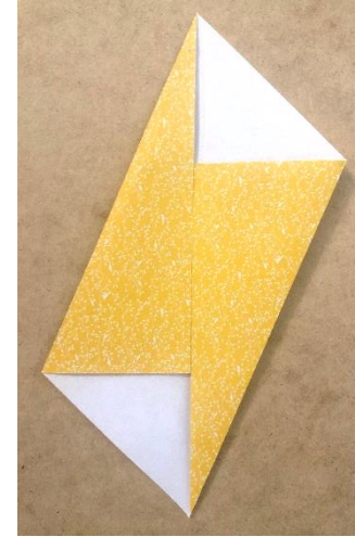
4. Fold down the top left corner as picture also following the central line. Try to make sure the folds go right to the corners to create a