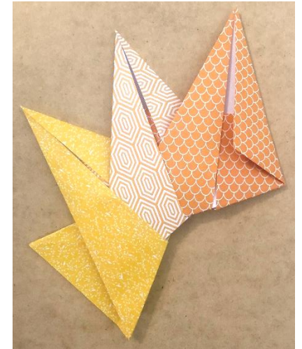
13. Continue adding all 9 shapes in this way. You may have to wiggle them around a little to fit